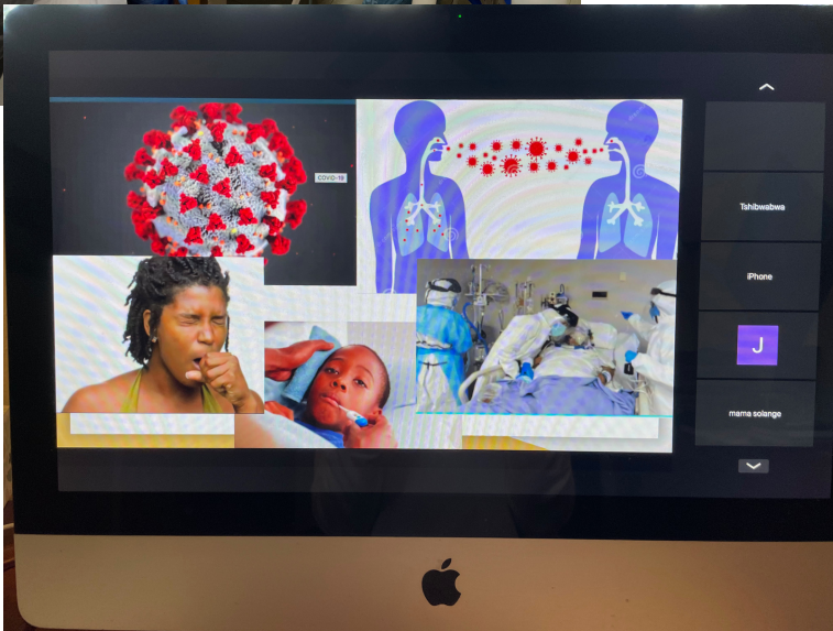
COVID-19 infection prevention information Zoom class