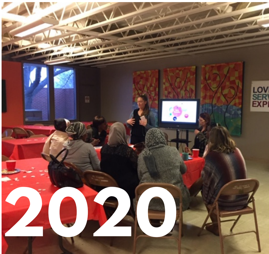
Women's health class in February 2020

2020 is Umoja ABQ's first full year of operation as a non-profit. The year began with plans for in-person classes and activities, but our in-person events ended abruptly after the COVID-19 lockdown began. Our last meeting was on March 8, and for the remainder of the year we moved our services online.