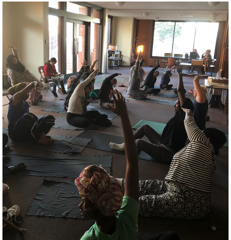
Yoga class before the COVID-19 pandemic

Computer Skills: Eight women, learning Microsoft Office