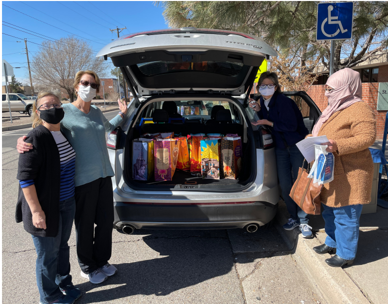
Volunteers distributing donations

of the women we serve are heads of households, have never attended school, and have large families with up to 11 children.